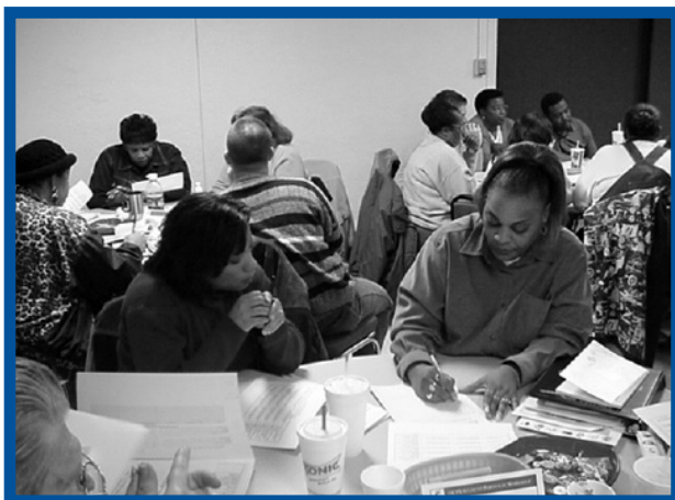
Student Portfolio Workshop

Not only is the District working to change the curriculum, its efforts are being enhanced by support from local colleges, universities, post-secondary institutions, businesses and community partners. These partners will work with the District to carry out the reforms initiated and develop a seamless pre-kindergarten through college education process.