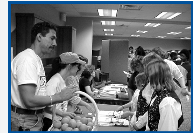
Back to School OCPS celebration at the Oklahoma City Zoo.

GEAR UP with families, schools, and our community partners . . .